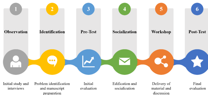
Figure 2. The Implementation method of community service activities

The evaluation process held consist of short initial observation of participants' perception as Pre-Test and post-test questionnaire in the end of the community service activities. The data was collected and analyzed using Excell Microsoft Office® tools and then followed by conducting polling data analysis using Likert scale. Likert scale can measure the variables of ideology, perspective, and training. Measurement of individual traits such as knowledge or attitudes by using the total score of the questions refers to interval measurements (Budiaji, 2018).