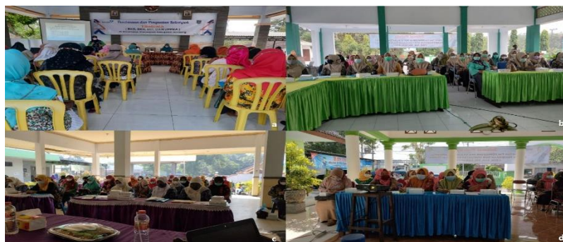
Figure 3. The Family Welfare Empowerment Workshop on Jombang Districts

Implementations of community service activities and solutions insight served in the material presented in the presentation applied in both the blended learning of online meeting in the form of teleconference and offline workshop. The online plenary meeting teleconference was held with the Jombang Regency's Family Welfare Empowerment Organization (PKK) leaders using PowerPoint and video presentations discussing the most current situation achievements and challenges on family welfare and resilience in the Covid-19 endemic era. The language used within this meeting is in Bahasa Indonesia as formal language and was held with fully official procedures, while in the discussion session also use a little bit of Javanese language. The plenary meeting focused on aligning the mindset for PKK coordinators in the regency level to assist the cadres in district level and grass-root below through better family understanding, perception, and attitude application in achieving better family welfare and resilience.