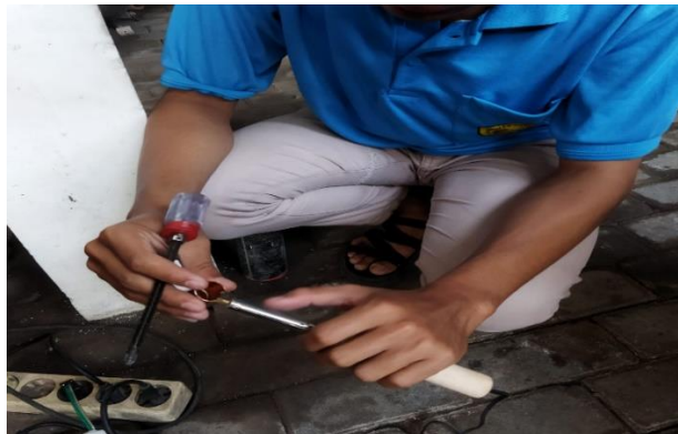
Figure 3 : The Process of Combining Canting Tubes and Solder