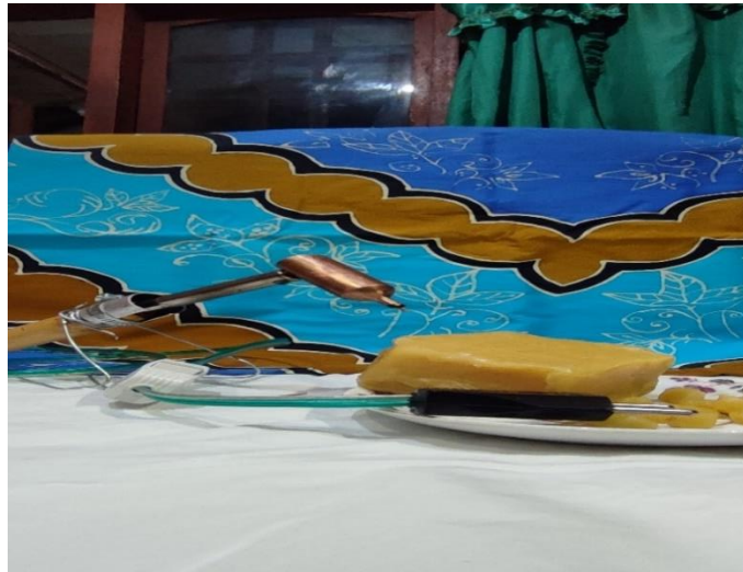
Figure 5 : Electric Canting After the Process Replace the Cable and Installing On/Off Button

After going through the assembly process and feasibility testing as shown in Figure 6, the electric canting is ready to be used by workers at UKM Batik Randu7 Mulia. Apart from having the advantages as shown in Table 1, this electric canting innovation also has other advantages, namely saving production costs for UKM Batik Randu7 Mulia. Calculation of production cost efficiency obtained through a comparison of production cost calculations with manual canting and electric canting is shown in Table 2.