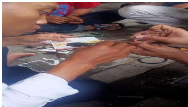
Figure 4 : Canting Cucuk Installation Process