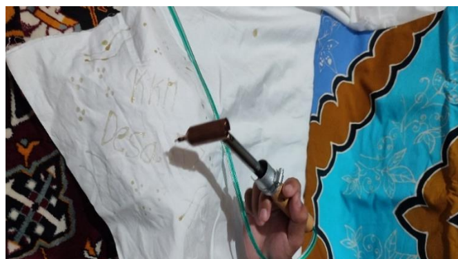
Figure 6 : Trial Results of Electric Canting

After going through the assembly process and feasibility testing as shown in Figure 6, the electric canting is ready to be used by workers at UKM Batik Randu7 Mulia. Apart from having the advantages as shown in Table 1, this electric canting innovation also has other advantages, namely saving production costs for UKM Batik Randu7 Mulia. Calculation of production cost efficiency obtained through a comparison of production cost calculations with manual canting and electric canting is shown in Table 2.