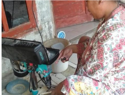
Figure 3. The Process of Making Tasbeh