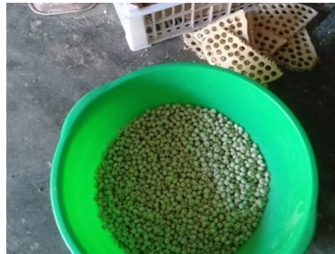
Figure 4. Tasbeh Production