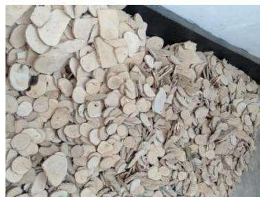
Figure 2. Raw Materials for Making Tasbeh